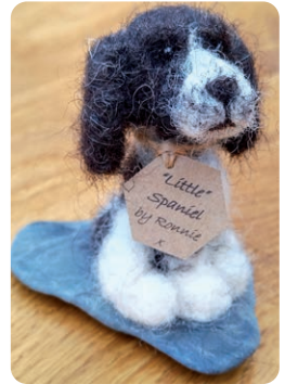
An example of needle-felting